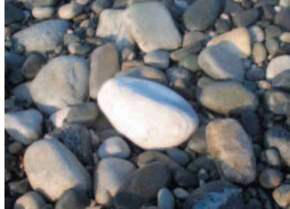
10. Full sunlight is layered on top.

overlying layer (Layer: Add A Layer Mask). When adding the layer mask, select the Hide All option that fills the mask with black and reveals 100% of the underlying image. Remember the mantra, “Black conceals, white reveals.” Where the top image is hidden the images below will be revealed below.