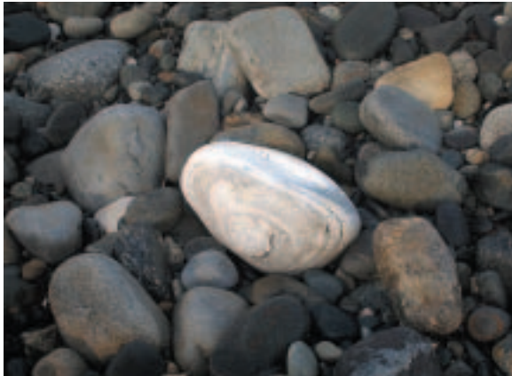
11. Full sunlight and full shade are composited in this image. This time, the central stone was dodged with a Curves adjustment layer. Light from the top layer (full sunlight) is partially revealed to provide the surrounding glow.