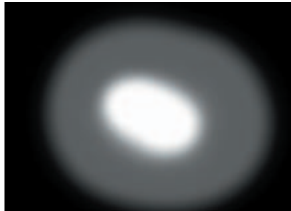
12. The mask used in the previous image.

grayscale images and Curves offers the most extraordinary control over the tonal scale, Curves is a superior tool to use to modify the density and/or contrast of a mask.