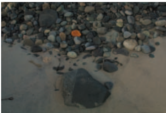
13. Full shade is used as the base.