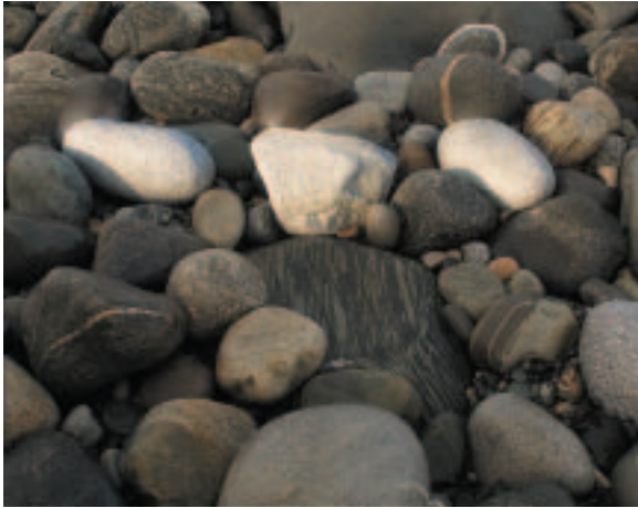
7. A layer mask is added to reveal the image in full shade below. Only three stones are visible from the image in full sunlight, dramatically driving the focus of attention to them.