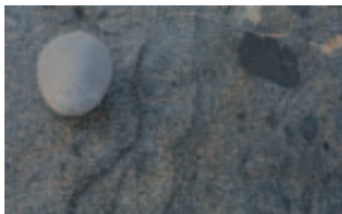
3. Full shade.