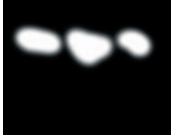
8. The layer mask used for the previous image.

misaligned. The image may lose focus if they are subtly misaligned. There is another technique that is very useful for registering two images that are alike. Turn the blend mode of the top layer to Difference. If the two images are perfectly in register the image will turn black. If instead there are brightly colored contours in a dark field, move the top image until the contours disappear. You can use the Move tool or the arrow keys on the keyboard to reposition a layer; a combination of both usually works well. (Note, you can only reposition the Background layer if you rename it first — hold the Option key and double-click on its title.)