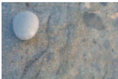
4. Full shade with reflection.

doing significantly alter a composition.