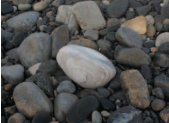
9. Full shade is used as the base.