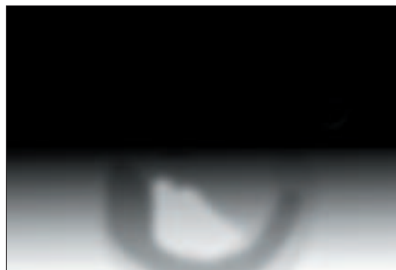
16. The mask used in the previous image.