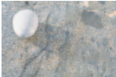
2. Full sunlight with reflection.