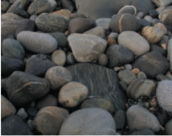
5. Full shade is used as the base.