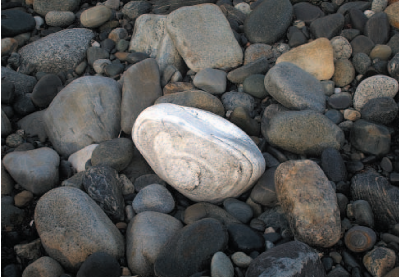
Solo i, Elemental, 2002