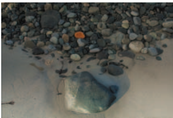
15. Full sunlight and shade are composited in this image. Here, the top layer (full sunlight) is blended into the bottom layer (full shade) with a gradient mask, creating a smooth transition from one lighting environment to the other. A small percentage of the shadowed version is brushed in surrounding the central stone, which acts similarly to burning down the area with a Curves adjustment layer.