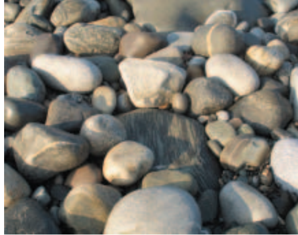
6. Full sunlight is layered on top.

down the effects of light to a definitive formula —0 over the centuries some of the greatest minds have tried — you can celebrate your particular experience of light, which will quite likely be unique. The more you look, the more carefully you look, the more you will be rewarded.