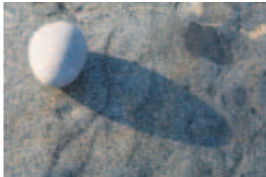
1. Full sunlight.

The many strategies for orchestrating light are similar to the objectives of “dodging and burning” or selectively lightening and darkening a single exposure image — create long smooth transitions between dramatically different tones or colors and/or accent small areas and downplay large areas (or vice versa). You might consider defining areas of light and dark in specific shapes — for instance bands of shadow and light — and in so